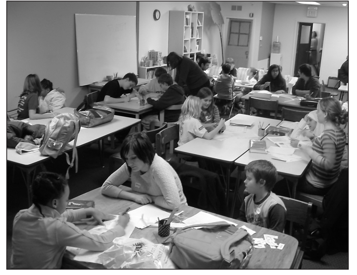
A typical day at 826michigan includes drop-in tutoring sessions like the one shown here.

826michigan makes opportunities like this possible for students every day. We believe that writing is an essential skill in life for everyone, and we know that providing students the chance to work oneon-one with professionals like Erik